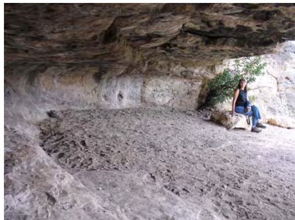
Figure 1. The smoke-blackened ceiling of this small shelter cave at Carlsbad Caverns National Park, New Mexico, suggests use by Native Americans and cultural significance.

This study examines “caves and karst” because not all caves and related features are karstic. Pseudokarst collectively describes cavernous landscapes and features formed by non-karstic processes. Pseudokarst caves formed by wind, stream, and sea and lake erosion of cliffs, fracturing of rock and soil, and out-washing of sediment from under a cap of harder material are typically small compared to karst caves. Volcanic caves, notably lava tubes formed by the draining of molten rock beneath a cooled, solidified roof, can be long and complex (see cover photo).