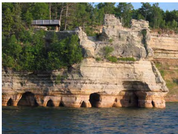
Figure 5. The small sandstone shelter caves of Michigan's Pictured Rocks National Lakeshore provide important evidence of modern and past lake levels in Lake Superior as well as refuges for aquatic wildlife.

Twenty-two parks, or 55% of respondents to the research section, reported the presence of solutional caves within their boundaries, the vast majority formed in carbonate bedrock. Volcanic caves were a distant second, with six parks reporting lava tubes, bubbles, rifts, etc. Four parks reported the presence of sea caves, five reported tectonic caves, and eight reported talus caves. Two respondents reported the presence of glacial caves within their park units, and two stated that they had no true caves, only rock shelters or bluff shelters formed by differential weathering (Figure 5). Eleven respondents reported the presence of karst springs, although only six parks had delineated the drainage basins of some or all of those springs. Wind Cave and Carlsbad Caverns were the only parks to report any research on paleokarst features within their parks.