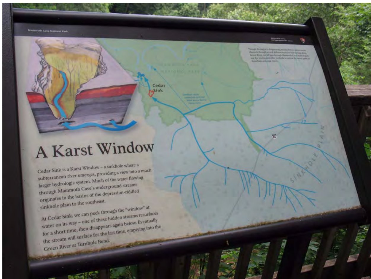
Figure 8. This exhibit at Mammoth Cave National Park, Kentucky, effectively conveys the concept of a karst window at Cedar Sink and how it is an integral part of an important groundwater drainage systems that extends far off the park.

cooperation and exchange of information between governmental authorities and those who utilize caves located on federal lands for scientific, educational, or recreational purposes (16 USC sec 2), as well as a management action that calls for fostering communication, cooperation, and exchange of information between land managers, those who utilize caves, and the public (16 USC sec 4).