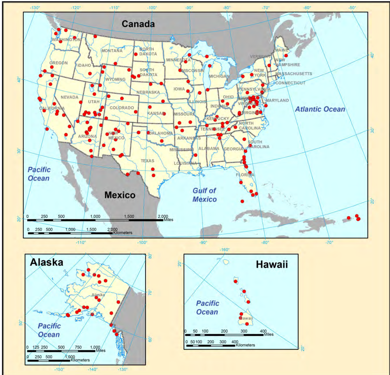
Figure 2. Locations of the 191 NPS park units identified by this study as containing or potentially containing caves, karst, and/or pseudokarst.

As a result, many scientists, technicians, and land resource managers are unaware or poorly informed about the unique character and fragility of karst landscapes.