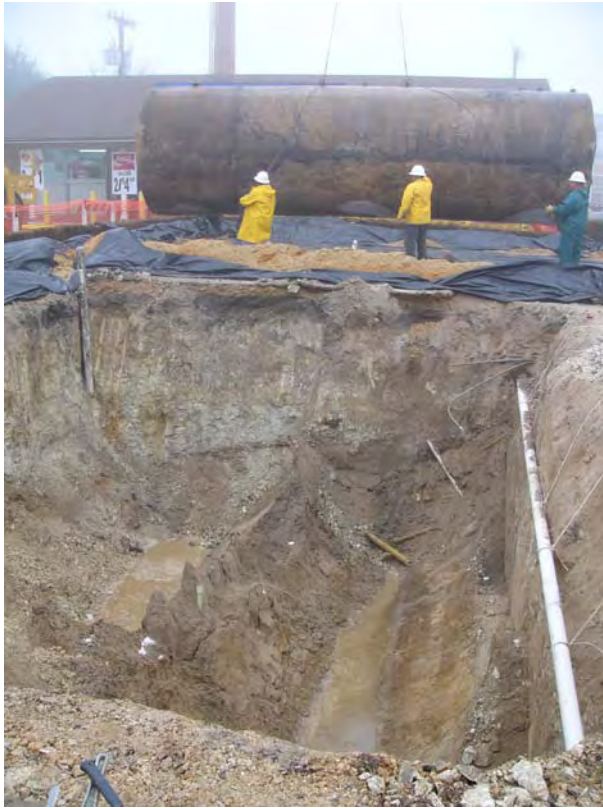
Figure 7. Hazardous materials storage facilities should be located outside of karst areas whenever possible, which in some cases may involve locations outside of the park units, such as this non-karst location where a leaking gasoline storage tank is being replaced.

locations for those facilities. Parks that have notable non-karst areas should evaluate relocating those facilities to their non-karst areas or off the parks (Figure 7).