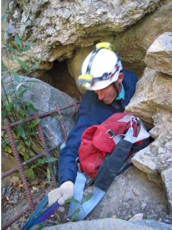
Figure 6. A steep climb and the nearly-hidden, narrow, and rubble-blocked entrance of Church Cave did not prevent its discovery in Kings Canyon National Park, California.

Protocols for the inspection should be developed. Volunteer cavers may often be available to conduct the inspections on behalf of park staff at little or no cost.