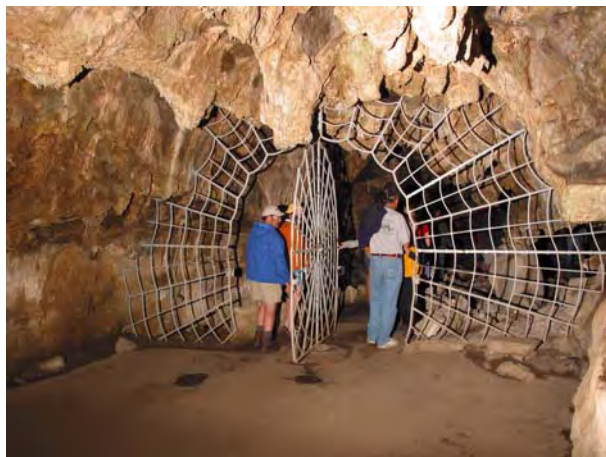
Figure 4. The major management challenge for show caves, such as Crystal Cave, Sequoia National Park, California, is finding the balance between presenting caves in attractive, safe, and interesting ways, while maintaining the integrity of the natural environment.

Eleven of the parks surveyed reported operating show caves (Figure 4), in most cases only one or two, although Lava Beds National Monument reported 22 show caves, far more than any other respondent. Seven parks also reported operating wild tour caves.