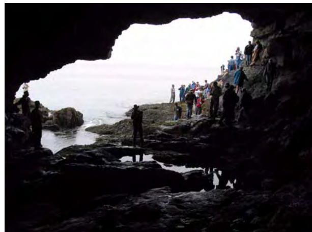
Figure 9. A field trip of biologists and geologists visit Anemone Cave, Acadia National Park, Maine, to both learn and share knowledge of the park's natural resources.

Several parks indicated that they were collaborating with external investigators, contractors, or volunteers to conduct research, education, or resource management within the parks. In many cases, solid science and education is being done because of these collaborative efforts. Such external support and collaboration may be critical to maintaining cave and karst management, research and education programs in the near future and should be supported whenever possible (Figure 9).